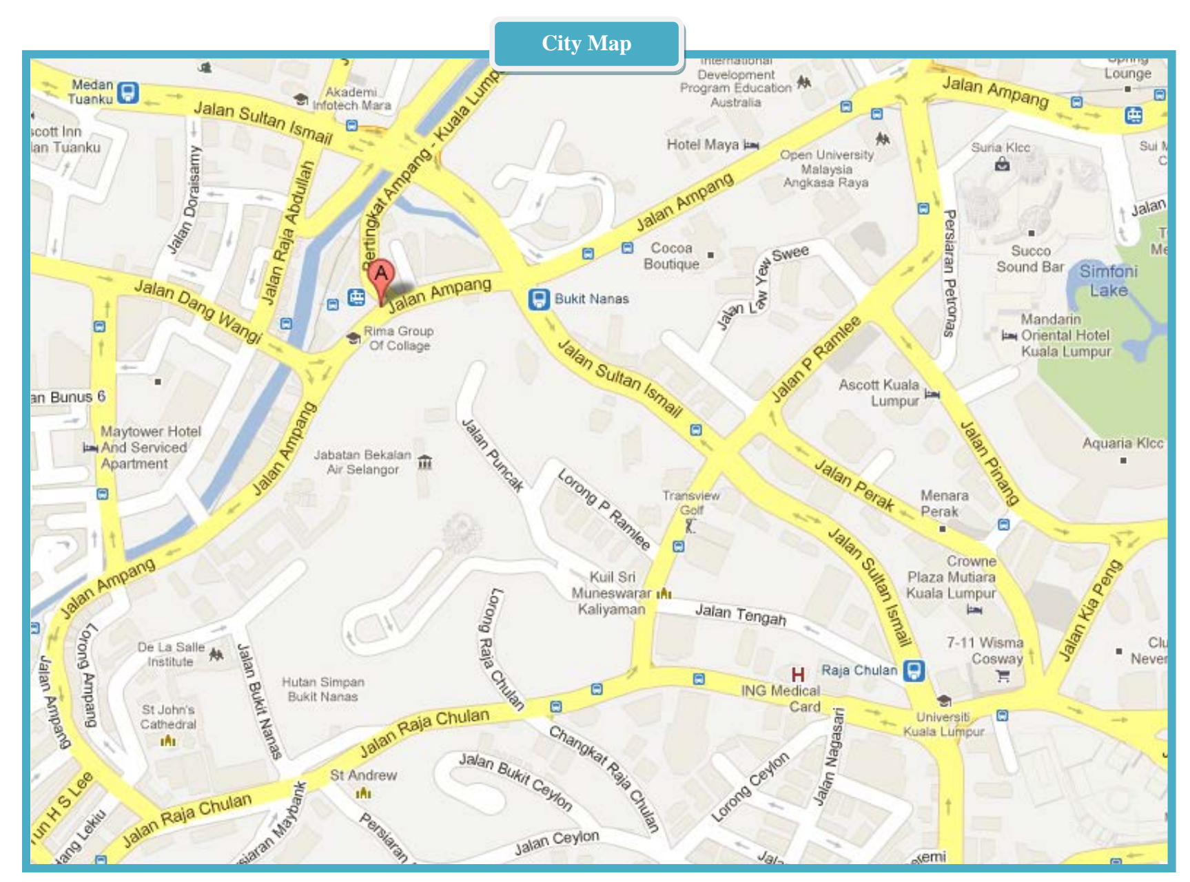
Point A: Renaissance Kuala Lumpur Hotel 5*